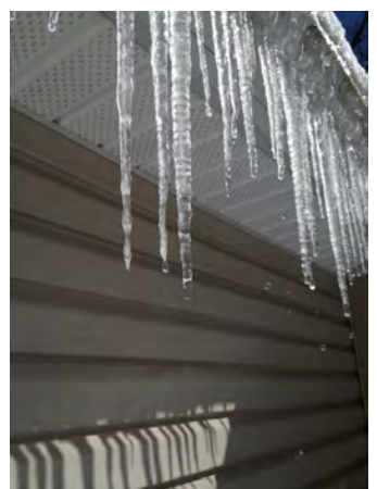
The ice is melting. The light returning. What can I shed? Where can I warm? What will appear this Spring?