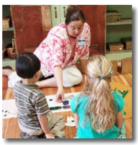
The parable of the mustard seed

My 8-month-old son was there, too. I was really struggling with postpartum depression. I needed worship. He needed me. Childcare wasn't optimal. Not knowing this particular group of Friends, I worried. Would we be a burden? How would we be received? What was their tolerance level for noise? It turns out we were not tolerated. We were not told that they "didn't mind his noises." No one told us about the child-care options for him. No, I found myself in a divine space. They didn't just tolerate us; they embraced us. They moved to sit near us. They said that they were glad that we were there, and worship was better for us being there, as messy as we were. Amazingly, the more a mess we were, the more it felt like they wanted us there, to hold us in prayer, support us in our tough places. They did not want us to leave in order to make their worship easier, more silent. It felt like they wanted us to stay, to hold us in prayer so that we could also worship. They wanted us there. Let's be clear. This was not one hour of worship. This was extended worship.