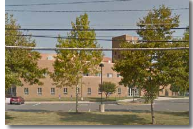
First Baptist Church of Lincoln Gardens

Coffee, tea and snacks will be available Saturday morning at the church. Lunch and dinner will also be provided at the church. Meal prices are shown on the registration form. Lunch will be available on Sunday at the Plainfield Meetinghouse.