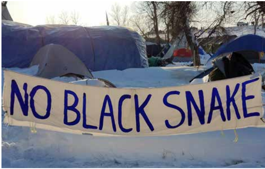
A banner at the Oceti Sakowin camp, Standing Rock, December 3, 2016. Some refer to the Dakota Access Pipeline as the "black snake," in reference to an old Lakota prophecy of a black snake that will come from under the ground, bringing destruction to the earth.