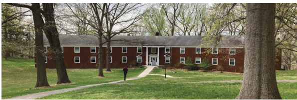
A Friend walks to Craig Dormitory.