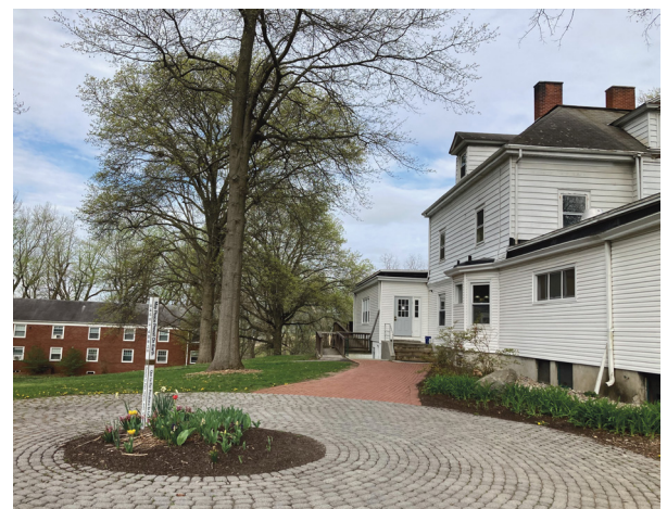
The path to Oakwood's dining hall.