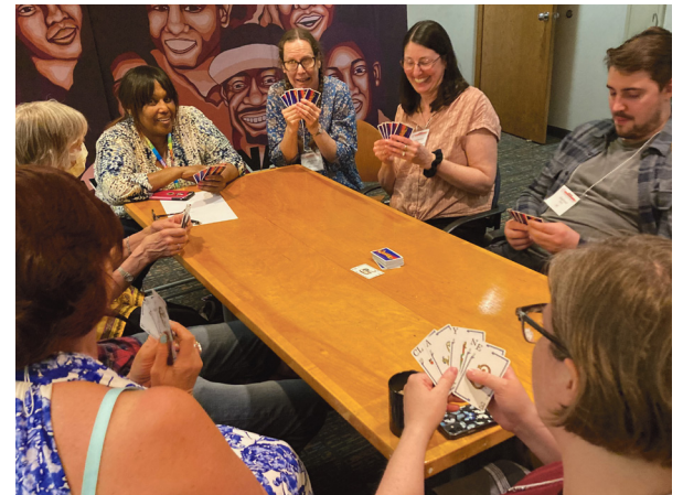
Friends playing "Quiddler" in the library at Spring Sessions 2023.

If you feel unwell, please stay home, regardless of COVID test results. If you feel ill at Oakwood, there will be test kits available and you will be asked to take a test.