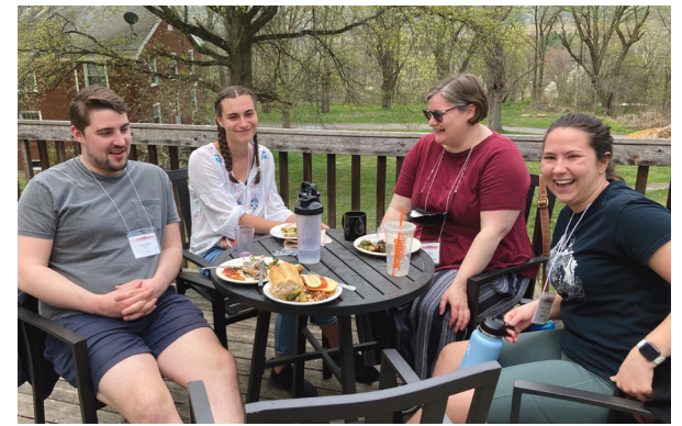
Friends enjoy lunch on the dining hall patio, Spring Sessions 2023.

Work with children. If your gifts lead you to contribute to the work of the yearly meeting through guiding the children, consider this your opportunity. We need resource people and group leaders; art people, games people, experienced old hands and newcomers. What we will have in common is delight in sharing time with children each morning during our time at Summer