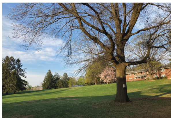
A grassy slope with one of Oakwood's dormitories to the right.

Sessions Committee agreed to the following suggestions about COVID safety: Masks will be optional. Friends are encouraged to take a COVID test at home before coming to Oakwood.