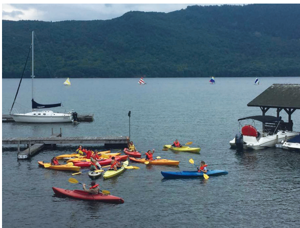
A group of young Friends heads out to hold worship on the lake using kayaks borrowed from Silver Bay, 2018. (This seems like a very COVID-safe way to worship in person—take note!)