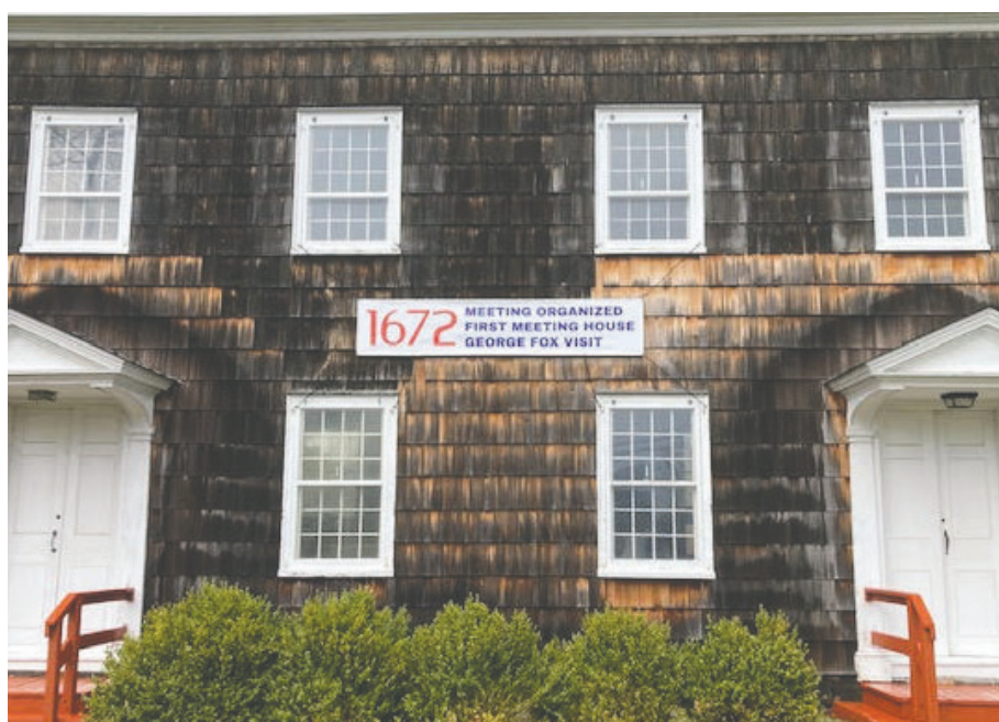
Photo of the Shrewsbury Meeting's 350th anniversary banner, hanging on the exterior wall of their historic meeting house. The banner reads, "1672: meeting organized first meeting house George Fox visit."