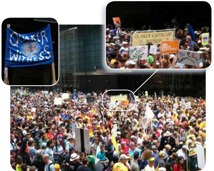
Friends at the People's Climate March