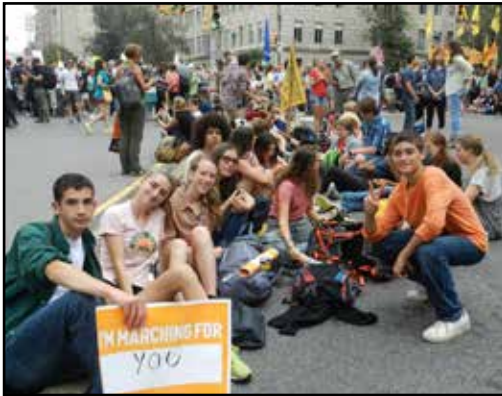
Young Friends at the People's Climate March

provided hospitality and other support to Friends traveling to participate in the March from the farthest reaches of the Yearly Meeting and beyond. The Witness Activities Fund helped pay for a bus from Ithaca for attenders of Farmington-Scipio Regional Meeting and a second bus for young Friends who asked to go to the March as part of their Powell House conference.