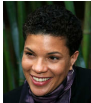
Michelle Alexander, author of The New Jim Crow